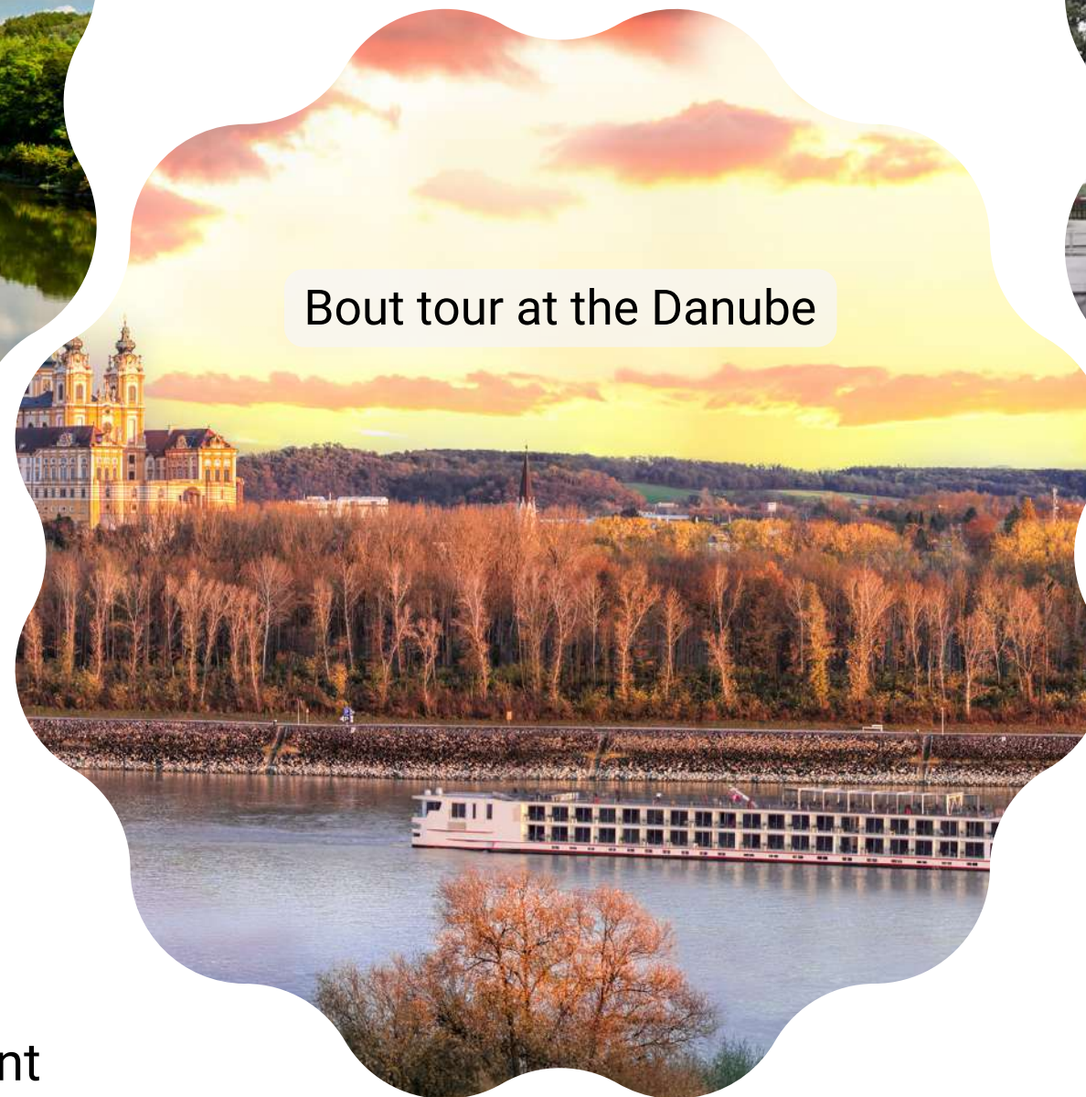
Bout tour at the Danube