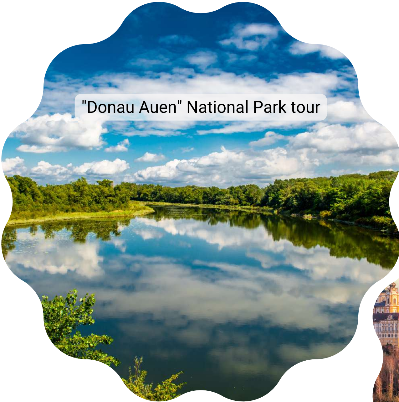
"Donau Auen" National Park tour