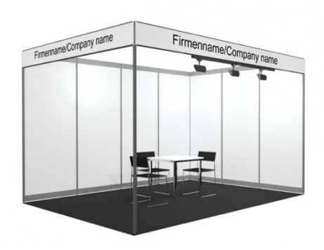
Example standard booth (Syma Systems)

All booths are equipped with a table, two chairs, lighting, sockets, carpeted floor, name sign (individually produced), side walls and include two conference participations (full registrations).